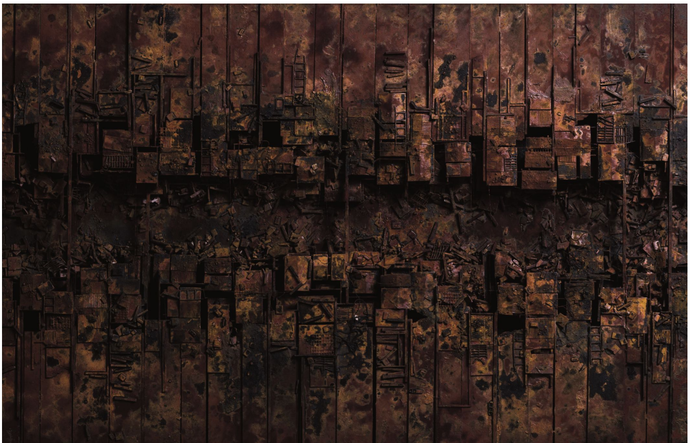
Hendrik CZAKAINSKI , The Ditch , 2022, mixed media on wood, 77 x 122 x 5 cm